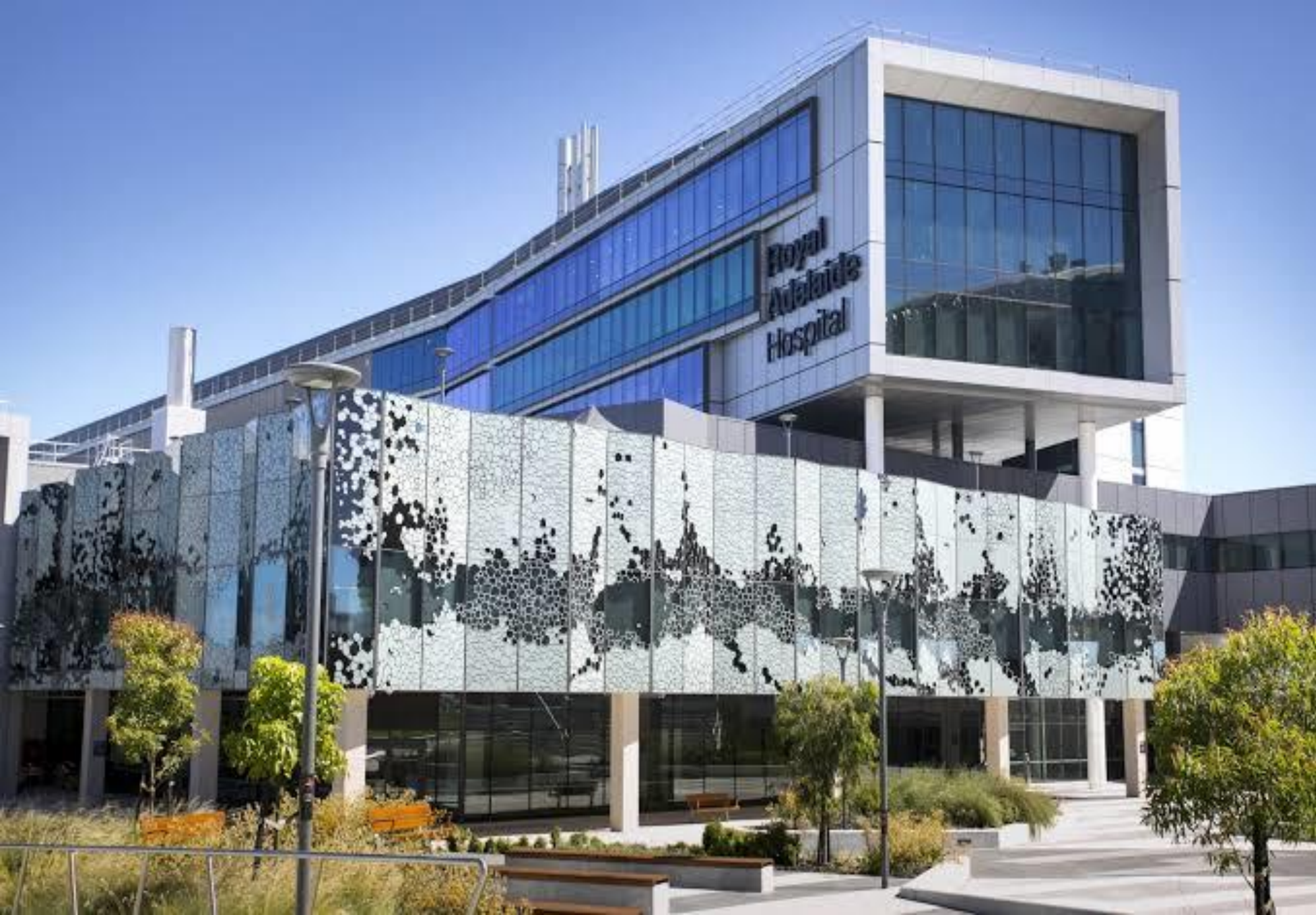
Royal Adelaide Hospital, Australia